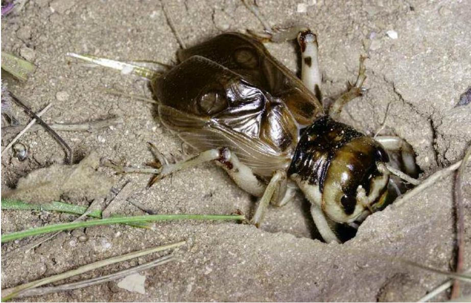
Fig. 1 — Brachytrupes megacephalus stridulating at its burrow entrance