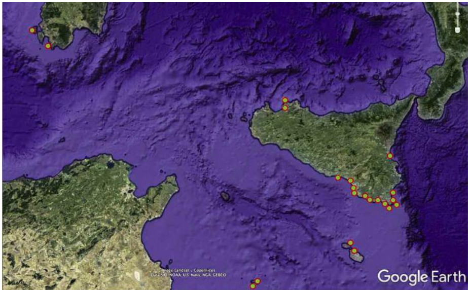
Fig. 2 — Indicative location of Natura 2000 sites on central Mediterranean islands that harbour B. megacephalus populations (source: CASSAR et al. , 2017). Beyond these Natura 2000 sites, the species is also known from the islands of Lipari and Vulcano (Aeolian Islands) (MASSA, 2011).